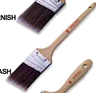
WILLOW THIN ANGLE SASH