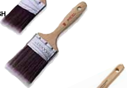
FIRM SABLE VARNISH