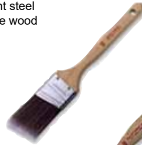
LINDBECK ANGLE SASH