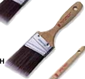
LINDBECK SABLE ANGLE VARNISH